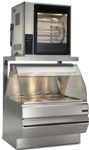
RMB 363 rotisserie merchandising base shown with SCR 6 rotisserie and HMR 103 self-serve merchandiser

The Henny Penny rotisserie merchandising base is an attractive, sturdy display unit designed to integrate rotisserie cooking and self-service merchandising into one convenient freestanding station. Cook, display and sell all from the same compact footprint!